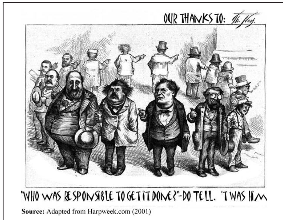
Figure 4 Thomas Nast cartoon, Harper's Weekly , during coverage of the Tammany Hall scandal, 1871

Assessment, the fourth phase, is accomplished in a meeting. Assess tactical actions at meetings held as a daily, weekly, or monthly “huddle” that starts with a question about what