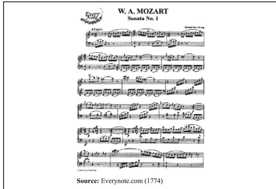
Figure 1 W.A. Mozart, Sonata No. 1

In the same way, a strategic plan is not meant to be read. It is meant to be implemented. Let me say that again. A strategic plan is meant to be implemented.